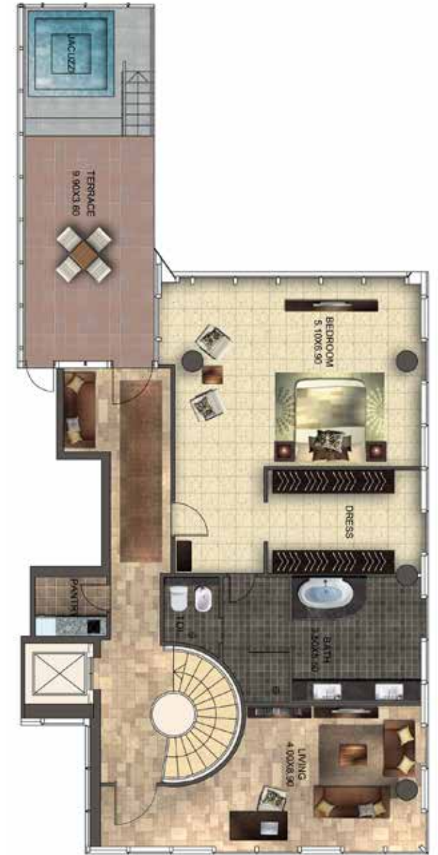
UPPER LEVEL & TERRACE